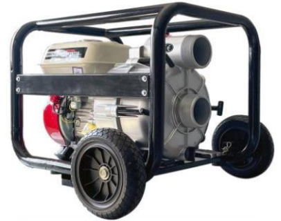
HIGH PRESSURE WP20H HONDA